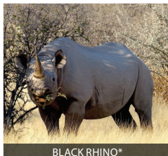
BLACK RHINO *

MARCH 16 to MARCH 27, 2023 (12 days/11 nights)