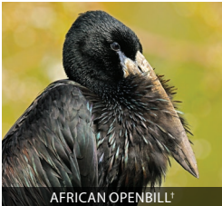
AFRICAN OPENBILL †