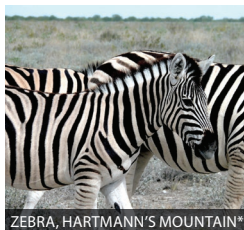
ZEBRA, HARTMANN'S MOUNTAIN *