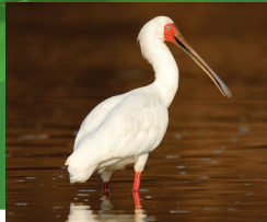
AFRICAN SPOONBILL †