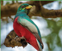
NARINA TROGON †