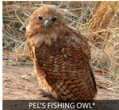
PEL'S FISHING OWL *