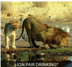
LION PAIR DRINKING *