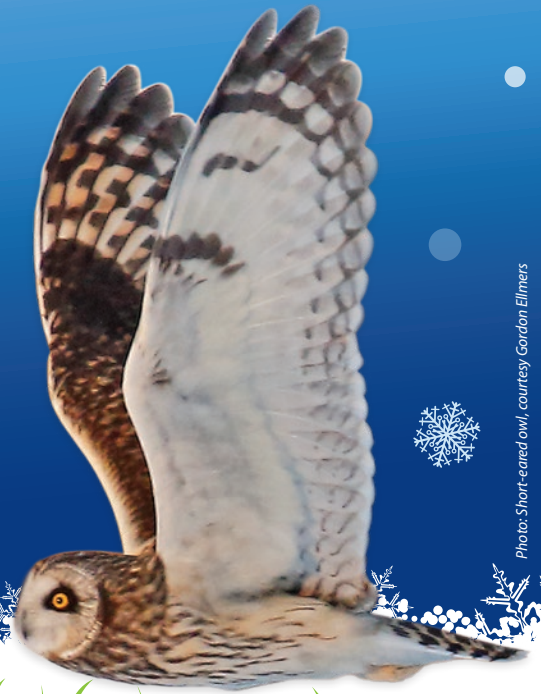
Photo: Short-eared owl

Check out what we accomplished in 2020 and our plans for 2021.